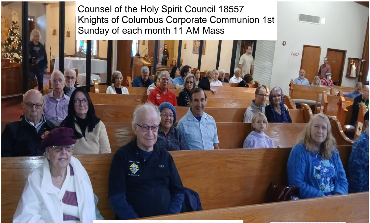
Counsel of the Holy Spirit Council 18557 Knights of Columbus Corporate Communion 1st Sunday of each month 11 AM Mass